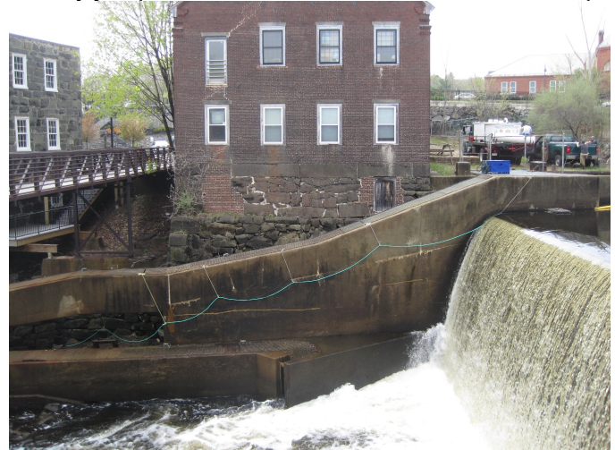
Anatomy of the Macallen Dam fish ladder (Switch back is out of this photo at left.)

The Macallen Dam in Newmarket has a fish ladder that helps the fish get up and past the 20-foot high face of the dam. This fish ladder starts at the base of the dam and is very similar to a wheelchair ramp inside. Water flows down the ladder at a low slope and enables fish to swim up. Halfway up the vertical distance, the ladder turns back on itself for the second part of the ascent to the top of the dam. Inside the ladder are regularly spaced rest nooks where the fish can get out of the strongest flow before the next hard effort upward. This model is different from salmon fish ladders, where the salmon literally jump out of the water to reach the next step.