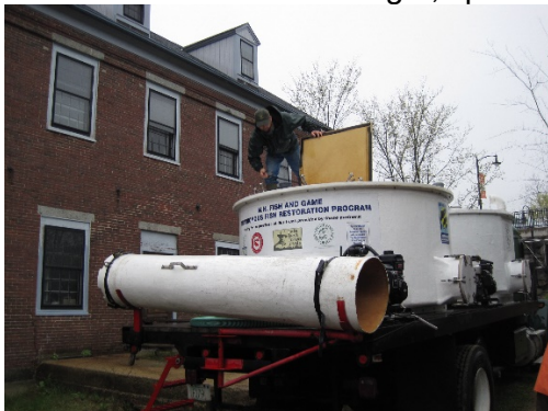
NH Fish and Game fish transport truck

are willing to go through alone. This hole cannot be made larger, is this is where the fish counting device is located and too many fish going through at once does not yield an accurate count. Enter the NH Fish and Game biologists! Every day during the river herring run in spring, these dedicated professionals and volunteers visit each of the seven fish ladders in New Hampshire and literally transfer nets and nets of thrashing fish from the holding tanks to the freshwater of the river. They also take basic measurements such as length, species, and sex.